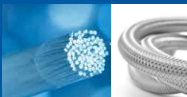
FIBER OPTIC CABLE

The two fiber-optic cables are protected by a Teflon flex hose encased in a 1" braided stainless steel sheath. The hose and two sensor eyes on the sensor head are kept clean with purged air from the control cabinet.