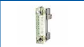
PAIR WITH ELF purge flow meter