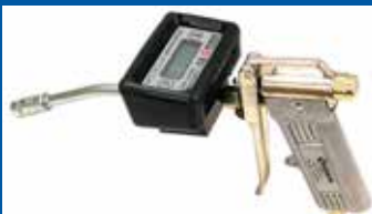
GREASE METER GUN